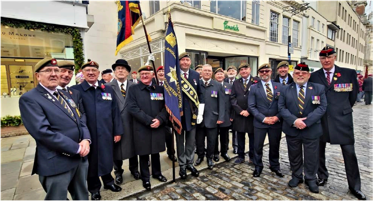
The Colchester Branch on Parade for Remembrance Sunday