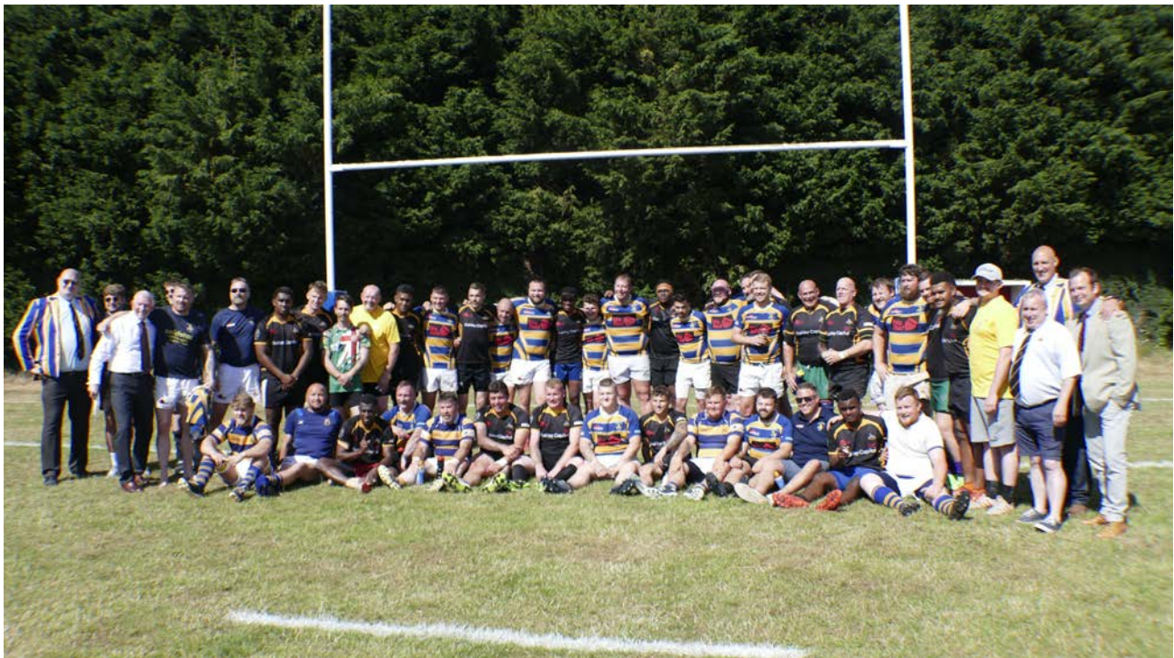
The Spirit of Rugby - Both Teams Gathered Together after a Hard-Fought Game

The day rolled into the evening and in good Regimental tradition the first and last pint consumed on the premises was by a Royal Anglian. The team and supporters gather again on 03 rd September at Syston RFC in Leicestershire. Details are available on the Regimental Rugby page on Facebook or email the Secretary on wilkie332@hotmail.com Hope to see you there.