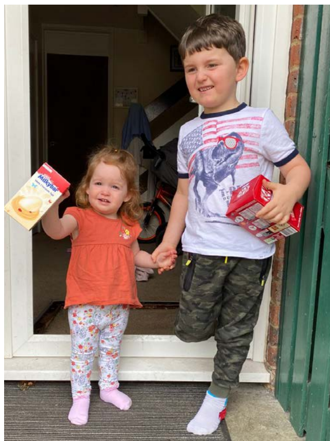
Pictures from the great Easter Egg Dash at Woolwich are courtesy of the Welfare Team at the 1st Battalion.