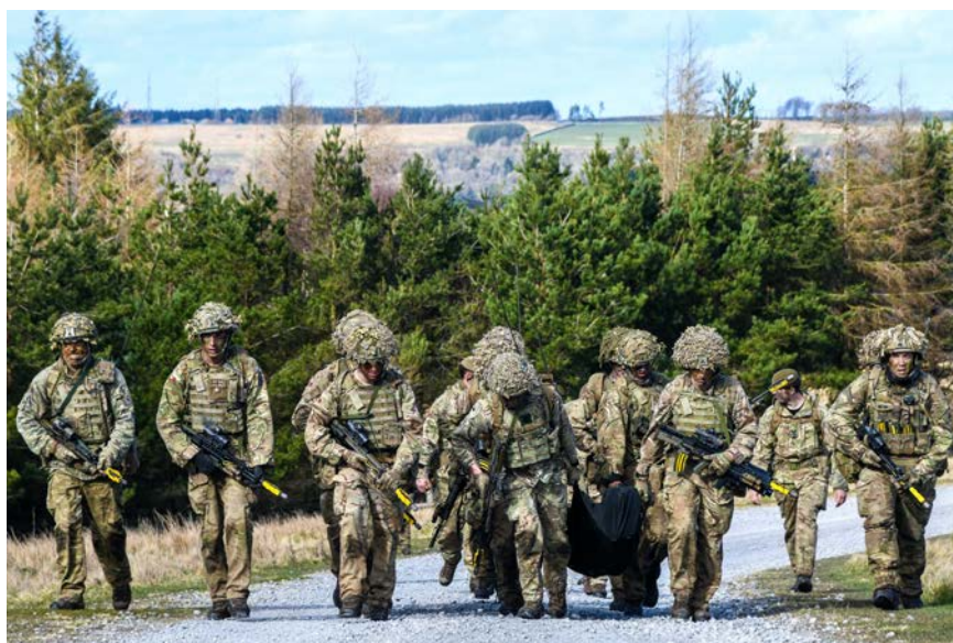
Train hard, Fight Easy - A Section carrying out Casualty Evacuation

The Vikings spent the first half of April on Easter leave, drawing a line under an extremely busy first quarter. As the Commanding Officer briefed the Battalion after a final arduous CO's PT, whether it has been on Op RESCRIPT, in Ghana, across the UK, or supporting 7 Brigade in the US, the Vikings have constantly performed well over the preceding months. After packing away the tyres, and the jerry cans, and the weights, and the logs (you get the picture!), everyone departed on two weeks leave for some well-earned time with family and friends. Maintaining their strong connection with the Regiment, the Worshipful Company of Poulterers kindly ensured those soldiers with families went on leave with a clutch of chocolate eggs (ideally for the children!) The Vikings – along with the Poachers and Steelbacks – thank the Poulterers and RHQ as well as the Vikings Welfare Team for their involvement. These kind touches underline our ethos: a county-based Regiment, bound together by a closely-knit family spirit.