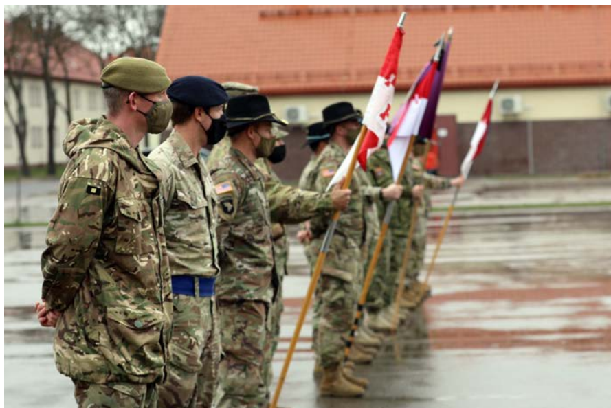
Poachers on parade with British and American Cavalry