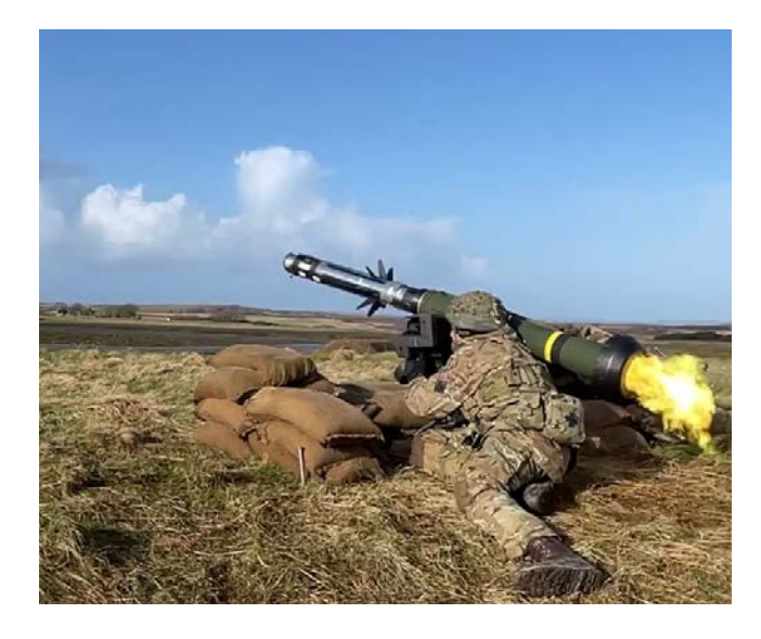
D Coy live firing Javelin AT Missiles at Warcop.

The start of the month saw D (Bedfordshire & Hertfordshire) Company, at Castlemartin ranges conducting Ex STAGS GUNNER 2. The exercise involved live firing from their Jackal vehicles, as well as firing NLAW, and Javelin missiles at the culmination of the exercise. The Company then took well earned leave prior to deploying to Poland on Op CABRIT this April.