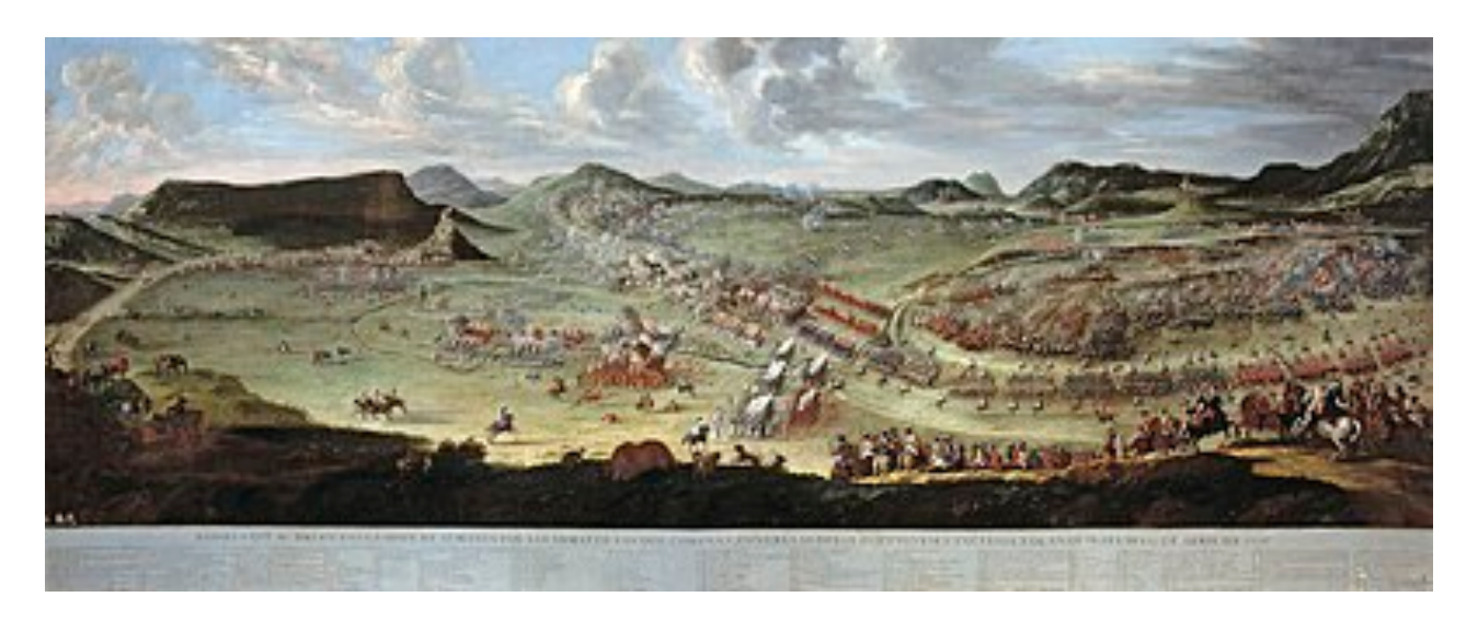
The Battle of Almanza - 25 April 1707, Painting by Ricardo Balaca

Almanza Day used to be celebrated by the Royal Norfolk Regiment, but on formation of the 1st East Anglian Regiment in 1959 the custom rather fell into disuse. It is however marked today by the 1st Battalion.