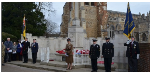
The Lady Lord Lieutenant, flanked by buglers from the local Sea Cadets.