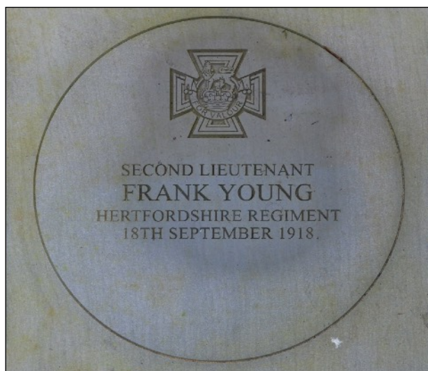
The Commemorative Stone