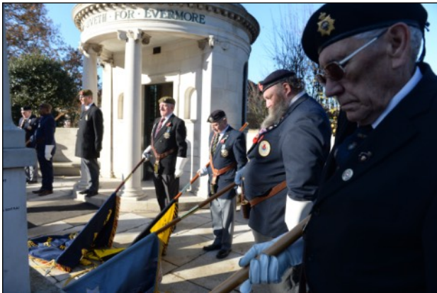
Dipped Standards in front of the Grade 2* Listed War Memorial to the men of the Bedfordshire and Hertfordshire Regiment, The Bedfordshire Regiment and The Hertfordshire Regiment