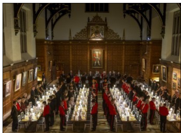
The Hall at Trinity College Cambridge 2018.