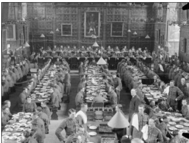
The Hall at Trinity College Cambridge, 1914 - 1918.