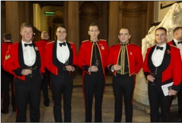
Members of the Regiment at the dinner.