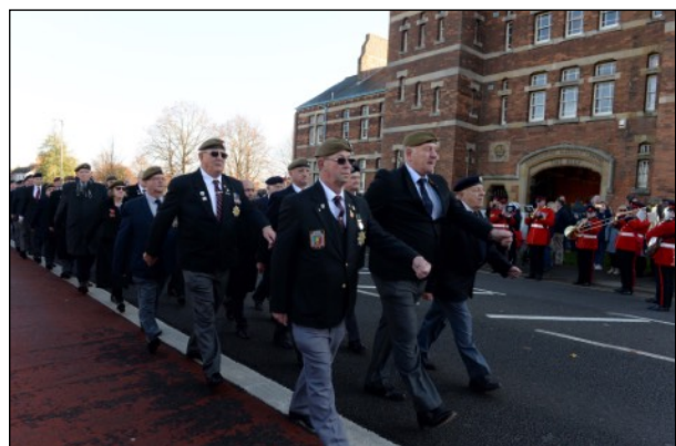
Old Comrades march past