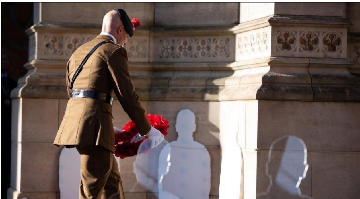
The Poachers have marked the 100th anniversary of the Armistice with services in Cyprus and Leicester.