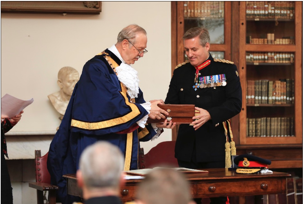
The Mayor of Gibraltar, HW the Mayor, Hon Adolpho Canepa presents the freedom scroll to the Colonel of the Regiment.

A ceremony was held at the Garrison Library on Saturday to confer the Freedom of the City to the Royal Anglian Regiment. The ceremony was conducted by the Mayor, Adolfo Canepa.