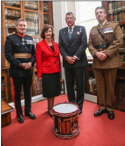
(L) Re-presentation of a 2 R ANGLIAN Drum. In 1969 during their tour in Gibraltar, 2 R ANGLIAN had presented a Drum to the Gibraltar Regiment. The Friends of Gibraltar had recently had this drum refurbished for the Royal Gibraltar as a symbol of the close relationship between the Royal Anglian Regiment and the Royal Gibraltar Regiment.