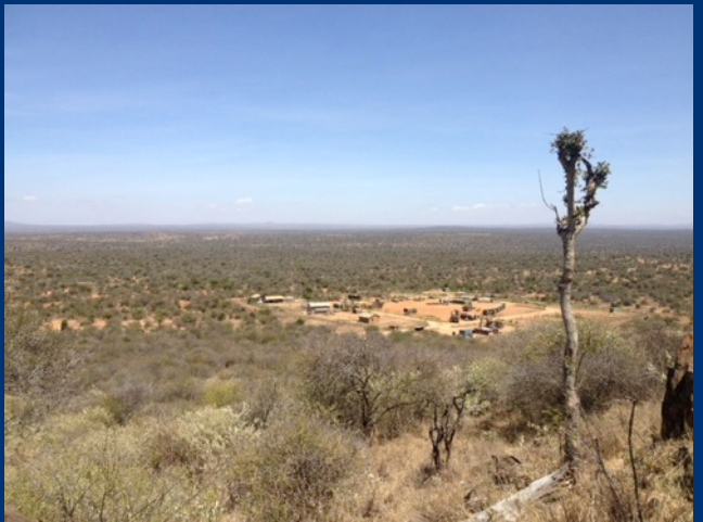
The Vikings continue their arduous training in Kenya on Ex ASKARI THUNDER 5