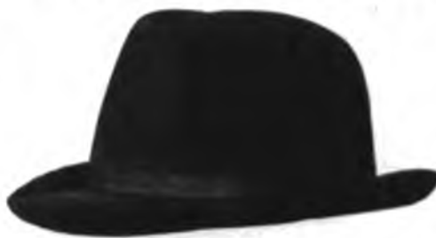
Dual-purpose hat, in brown, green or grey. Style 6153