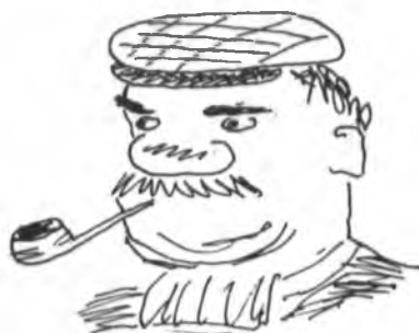
THE SOMME & PLUM & APPLE