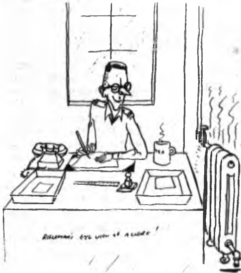
RIFLEMAN'S EYE VIEW OF A CLERK!