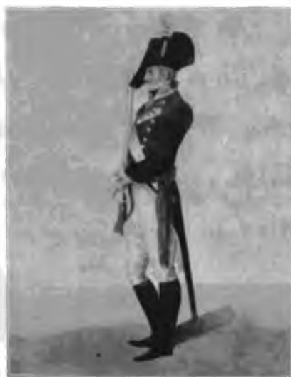
An officer of the 17th Regiment of Foot 1800. Now the 4th Leicestershire Battalion Royal Anglian Regiment.

Our latest military catalogue is now available