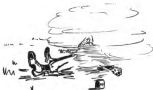
THE R.S.M. DEMONSTRATED GAS EFFICIENTLY

This exercise proved that weekend soldiers have the stamina and ability to live under arduous conditions and to be cheerful under trying circumstances. It emphasised the importance of physical fitness to enable us to take our place alongside our regular counterparts, if called upon to do so.