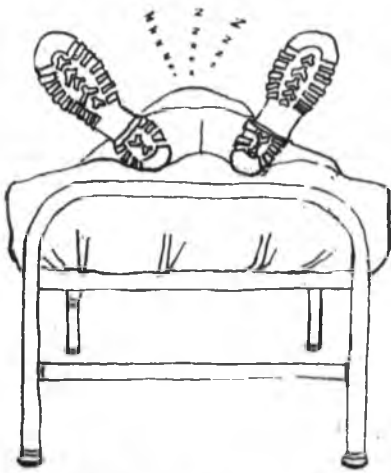
CLERK'S EYE VIEW OF A RIFLEMAN!