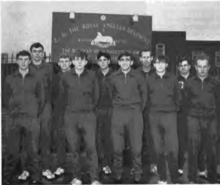
Cross Country Team.