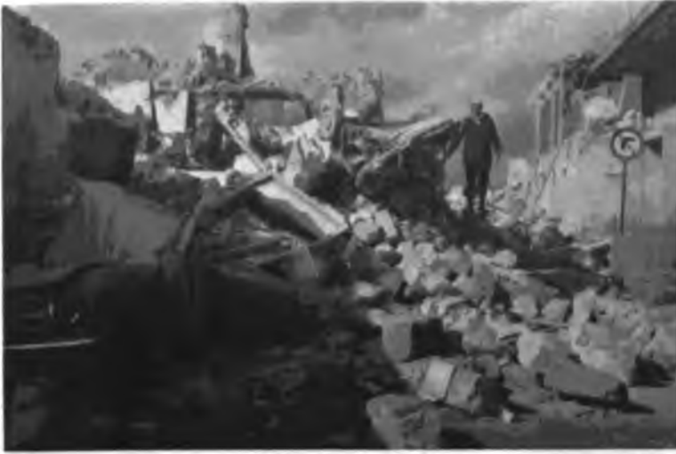
Typical scene of damage at Montevago.

moved off to Partanna. The journey took about three hours. We passed through a number of villages on the way. They were all deserted. The inhabitants had fled to the nearby fields. A continuous stream of men, women and children, carrying their bedding and a few valued possessions, moved along the side of the road making for safer areas.