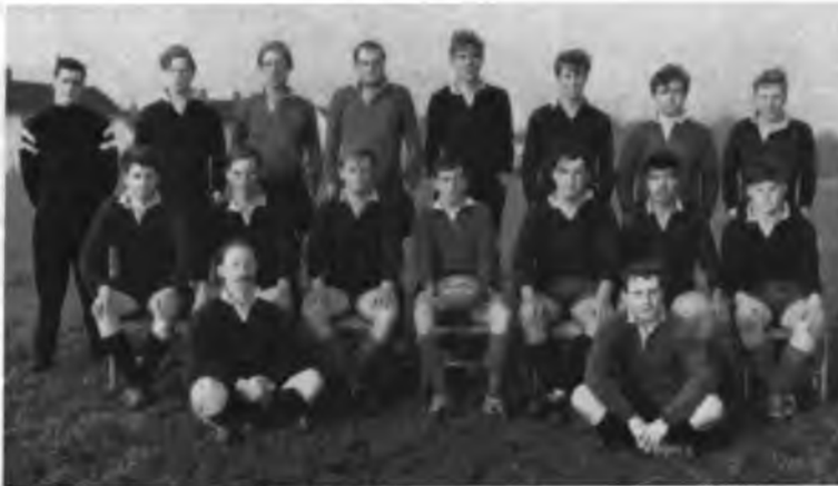
The Depot XV

By the end of week two, the better skiers had graduated to the higher lifts of the Kolbenalm and the Gemeinde and everyone was tested on a small downhill course (appropriately termed 'Mini-slalom'). Some of the competitors would have been better timed by watch than by stopwatch! Our gradings at the end were encouraging, and we had all had a useful introduction to a great sport.