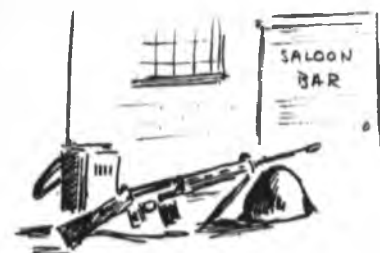
THE RECCE COULD NOT BE RAISED ON THE AIR