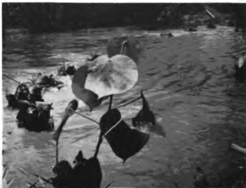
Below: First man over.