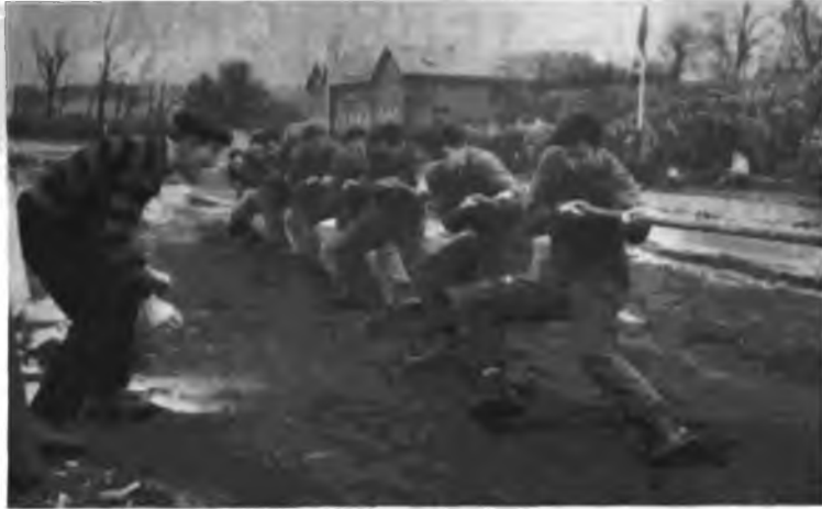
Winning team at Vordingborg.