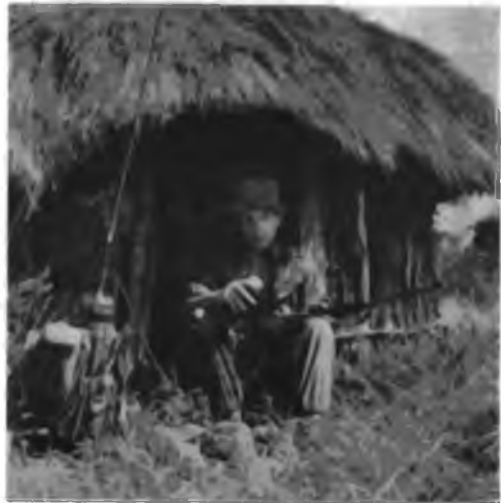
Fig. Hall—'An Englishman's home . . .'

The main problem facing the teams was not the physical effort required to get to the top but the rare atmosphere found at high altitudes and the sickness caused by it. This has unpleasant symptoms, headaches, nausea, giddiness (others managed these at lower altitudes with much less effort!) and the only cure is to go down to a lower altitude. It was therefore decided to make the expedition one of three days, the first being a half day drive up a track to 10,000 feet and to spend the night there to acclimatise to the altitude. The second day involved a climb of 3,000 feet over some 9,000 yards to a hut erected by the Mount Kenya Mountain Club and the third day was the ascent from the hut to the peak and then back to the vehicles by the roadhead.