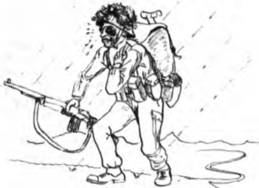
RIFLEMAN'S EYE VIEW OF HIMSELF!