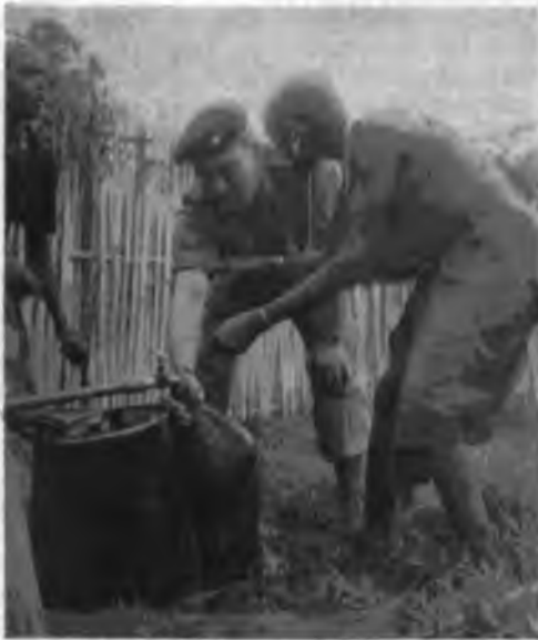
CSM Hazelwood and friends.

On a clear day it is possible to see Kilimanjaro, three hundred miles away. The view was breathtaking and Africa was laid out like a map. Behind the peak, on which there was a large cross, was the peak of Batain which soared up another 700 feet. It was extremely cold on top and after a few minutes the three set off down again. Almost immediately the mist came down and it began to snow hard producing a 'white out'. This did not last long and what had taken a hard three hours was descended in less than one hour. At the hut they had lunch and after a brief message on the radio to base to say that all was well they set off again down to the base camp again taking half the time to go down than to come up. At the base camp was the second party and after handing over the ice axes, radio, etc., seven very tired men climbed into the vehicle and returned to Nanyuki. As Lenana is higher than any peak in Europe it was probably the nearest any of them will get to Heaven on their own feet.