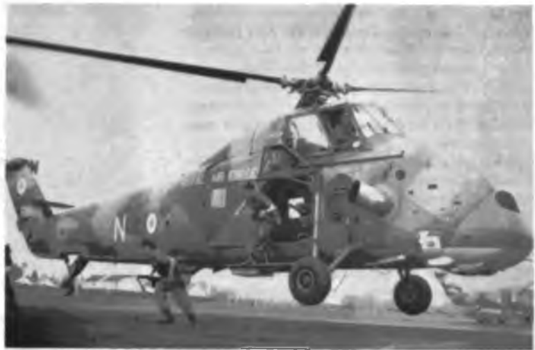
'C' Company debussing at Celle.