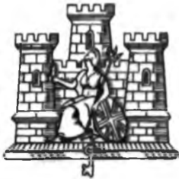
1st Bn. (Norfolk and Suffolk)