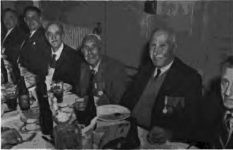
Happy customers at the Norwich Reunion Dinner.

of those who fell in this operation were placed on the Civic War Memorial after the Service.