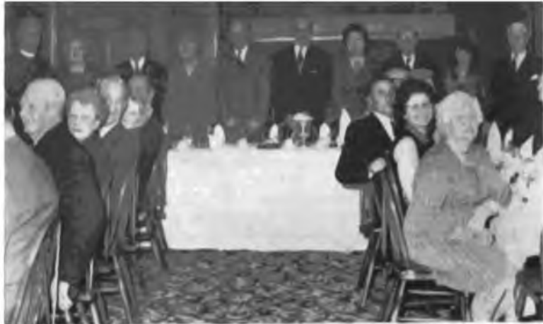
Members of the Association of Sergeants, All Battalions, The Essex Regiment at their Annual Dinner at Romford.