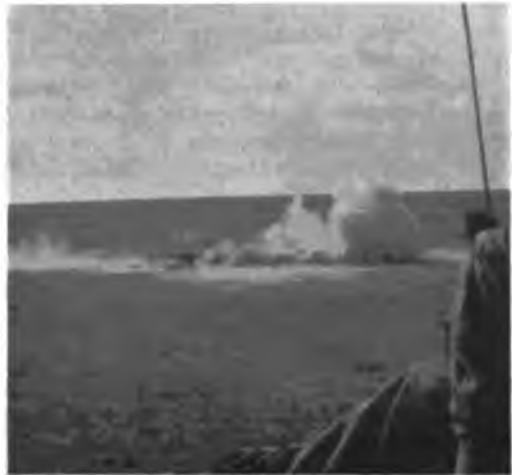
Half the visitors vanished!

The two lines of marquees made a dusty main street with a fancy corrugated cookhouse at one end and an oily MT at the other. Behind the marquees the Mortar, Anti-Tank and Recce Platoons squatted, their little pup-tents drawn up in lines like a canvas drill parade.