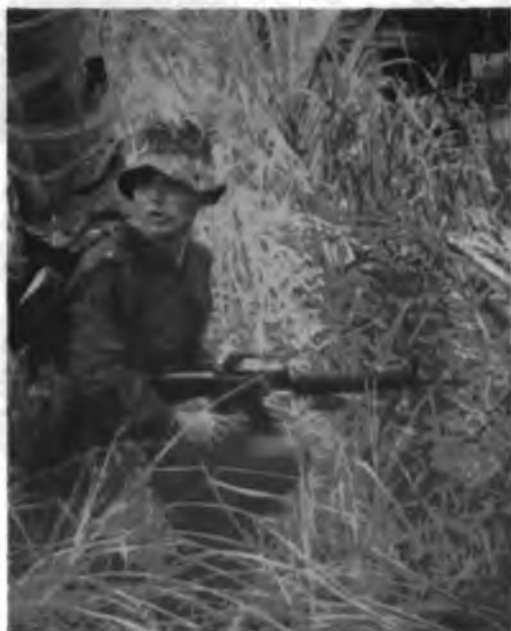
Come back, you fools!

We didn't spend all our time training but kept weekends as clear as possible for everyone to enjoy himself. The REME Admin Unit in Singapore very generously allowed soldiers to stay in their lines during weekends. This was most popular, 102 soldiers using this facility during the last weekend. It is always a temptation to train so hard and continuously that an exercise such as Willoughby becomes dull and monotonous. The weekends were needed to recuperate, swim, sunbathe and see the sights.