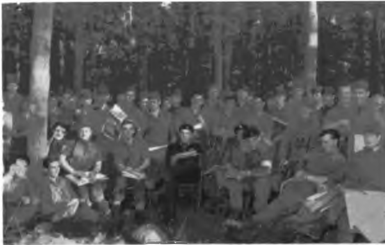
Typical conference on Exercise 'Hell Tank'.